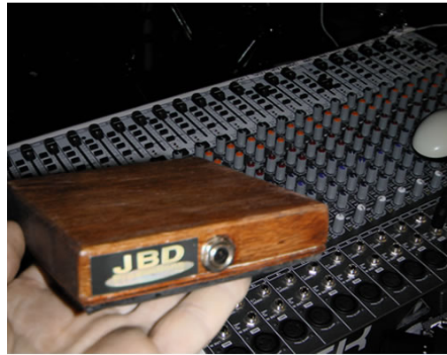
Stomp Box with Super Bass by JBD Productions www.jbdproductions.com.au